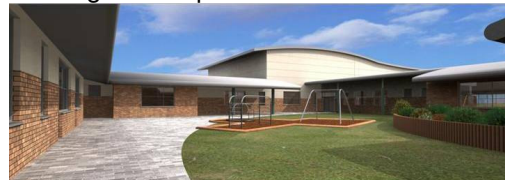
The new buildings and open courtyard

Mouchel design brand new purpose built buildings for a special school.